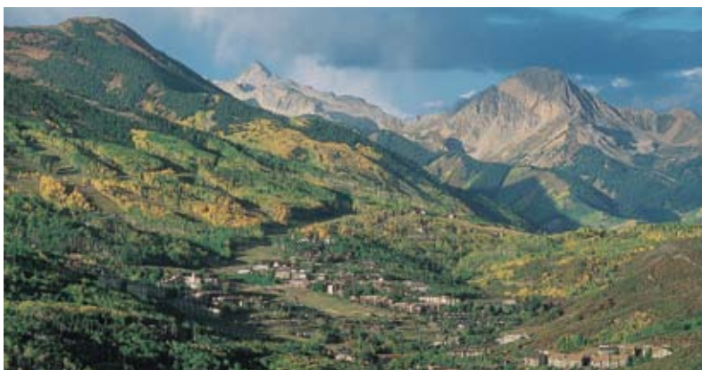
Snowmass in Summer

The hotel features complimentary Aspen Airport shuttle service, outdoor heated swimming pools and whirlpools, health club & spa, sauna, steam room and massage service. Full concierge and business services are available. Brothers' Grille is on property and the many restaurants and shops of Snowmass Village Mall are merely steps away. Silvertree Properties will offer traditional hotel rooms, studios and condominium units.